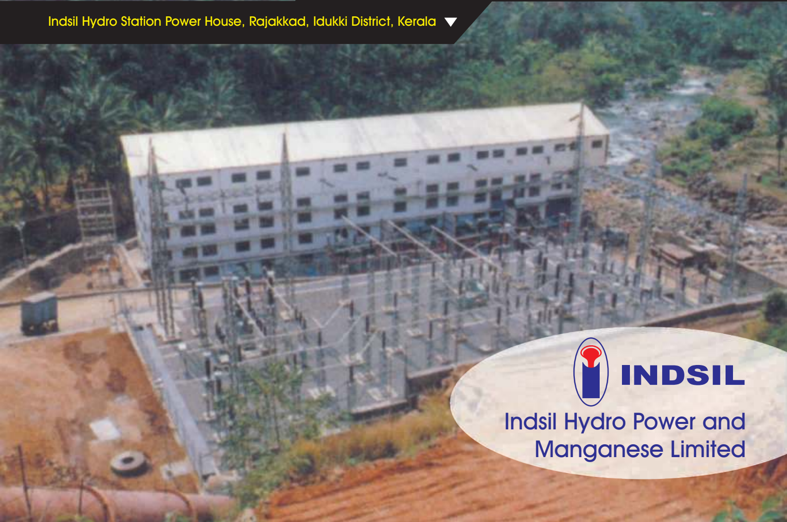
Indsil Hydro Station Power House, Rajakkad, Idukki District, Kerala ▼